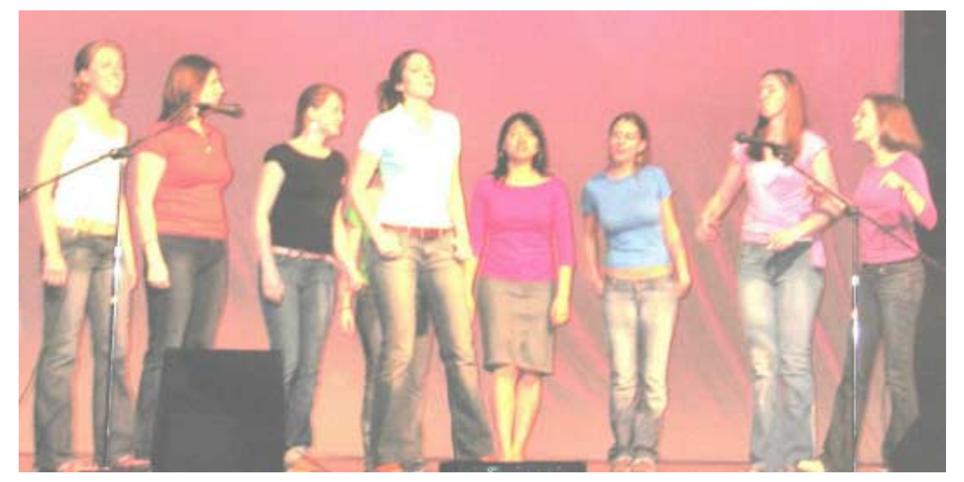
The Accidentals of Williams College perform at Mt. Greylock Friday night April 8 as part of a program that included Kusika, The Spring-streeters, and Mt. Greylock Acapella.